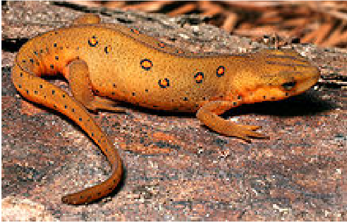
Eastern Red-spotted Newt (Notophthalmus viridescens)