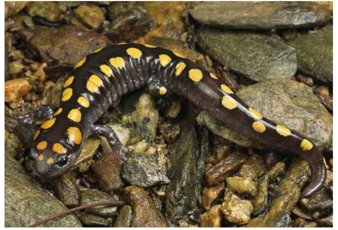
Spotted Salamander (Ambystoma maculatum)