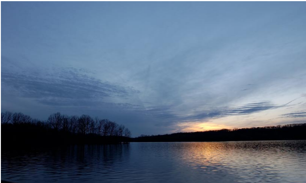
The lake at Gifford Pinchot State Park, York County

Audio interviews with noted environmental and conservation professionals conducted by historians, recorded, transcribed, and preserved in the collections of the State Archives.