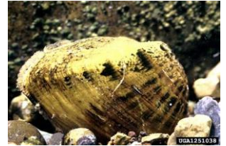
Snuffbox mussel

Additional information can be found at Snuffbox | ontario.ca .