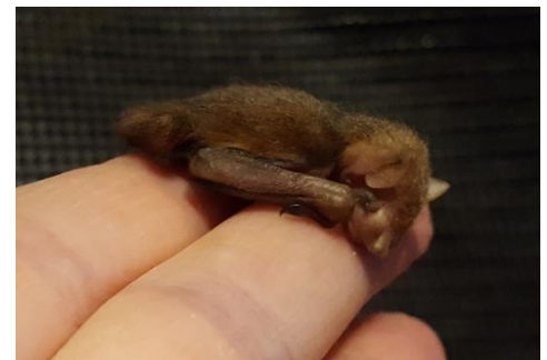
Tri-colored Bat ( Perimyotis subflavus )

Their significant numbers have been decimated 90% to 100% of their pre-fungal invasion counts in most areas, and the virus threatens to eliminate these species entirely if successful strategies to control it are not found very soon.