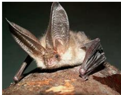
Northern Long-eared Bat ( Myotis septentrionalis )

Several species of bats naturally found in Pennsylvania and once plentiful here and throughout their large habitat range are rapidly becoming endangered to the point of extinction. They have just been named to the Federal Endangered Species List. Just a few years ago these bats were found in large numbers – that is until the White-nose Syndrome, a deadly fungus first discovered in 2016 in New York, made its debut. There is no cure for this fungus and now this pestilence has spread to the entire northern long-eared and tri-colored bat range, an area covering most of the east North American continent and stretching from southern Canada through Mexico.